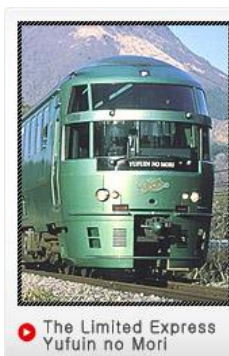
The Limited Express Yufuin no Mori