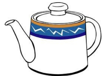
Kitchen and snack table

Self explanatory but pretty useful if you need to change into a suit, sportswear or (for the cyclists) out of a wet raincoat at school. Other teachers have lockers here to keep their stuff but ALTs might not. It's usually a small room attached to the staff room and sometimes there's different rooms for males and females so find out first! In my schools it's polite to knock once quickly before walking in.